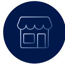
TRADE / RETAIL