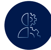
MECHANICAL & PLANT ENGINEERING